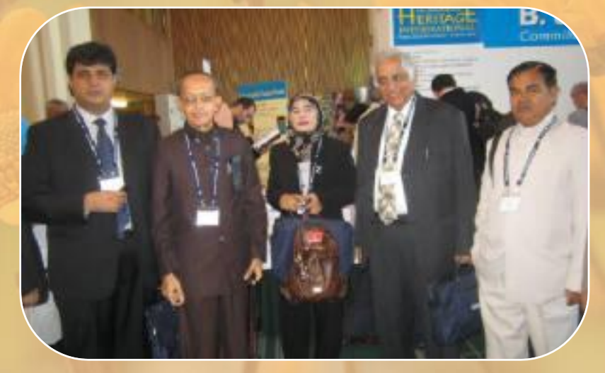
Asian League administrative board at the 63rd international Congress in Belgium (Oostende)

The League Executive Committee at the Congress in Singapore